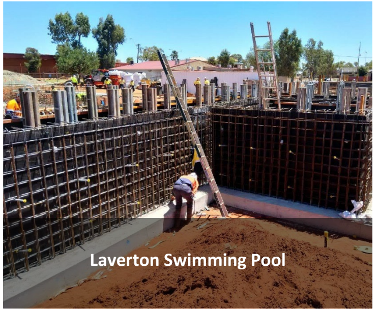
Laverton Swimming Pool