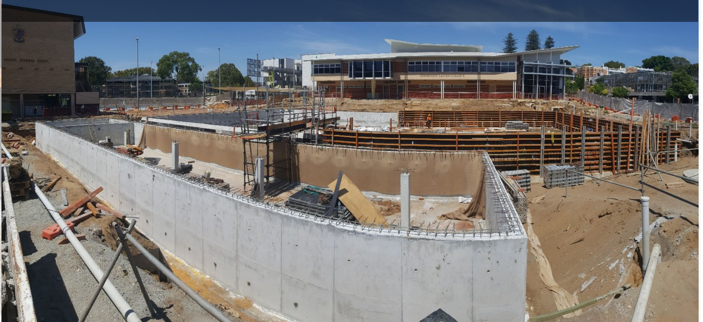
Methodist Ladies' College Swimming Pool